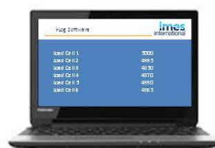
Hand Held, Software, Graphical & Log, large LED Display